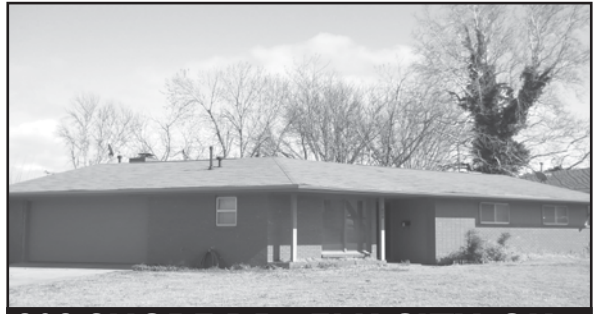
808 SHORE DR., ELK CITY, OK