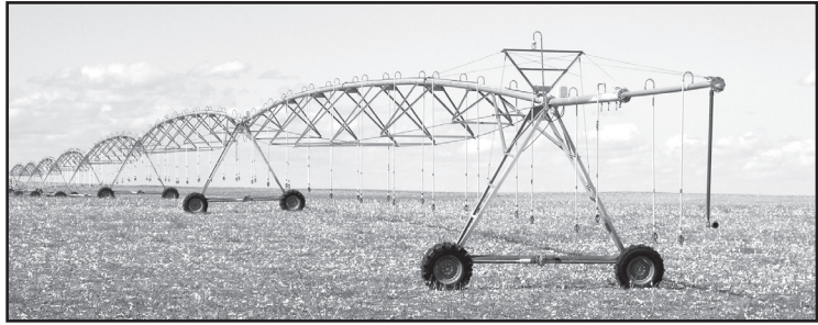
To view the property call 580-225-6743 for an appointment.