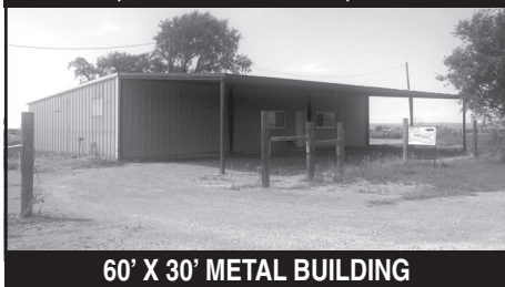
60' X 30' METAL BUILDING