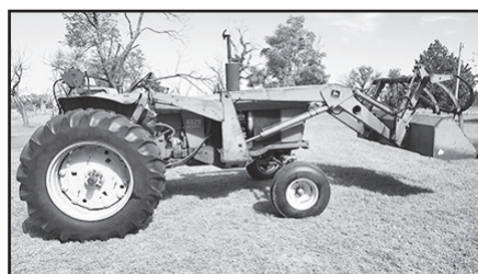
1971 John Deere Model 4020 Tractor Stored inside