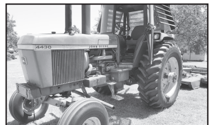
John Deere Model 4430 Tractor Stored inside