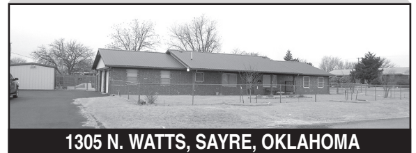
1305 N. WATTS, SAYRE, OKLAHOMA

Sunday, April 8 & 15 from 1:00 to 3:00 p.m. or by appointment 580-225-6743