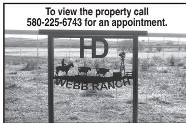
To view the property call 580-225-6743 for an appointment.