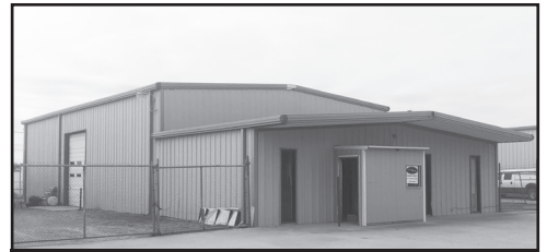
REAL ESTATE SELLS AT 11:00 AM