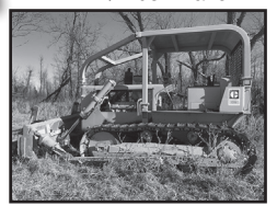
1973 Cat D-5 Dozer W/Brush Rake

WE INVITE YOU TO ATTEND THIS SPECIAL AUCTION!