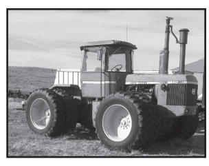
John Deer 8640 Tractor, Dual Wheel