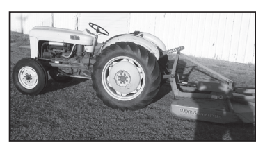
1953 Golden Jubilee Tractor and a Woods 5' Mower