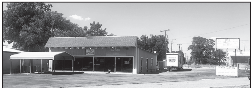
405 EAST THIRD STREET, ELK CITY, OK.

Brokers must pre-register client 48 hours in advance of auction.