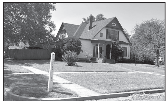
704 W BROADWAY, ELK CITY

BROKER PARTICIPATION INVITED: Brokers must pre-register client 48 hours in advance of auction.