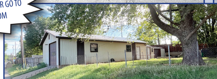
1800 SQUARE FOOT SHOP