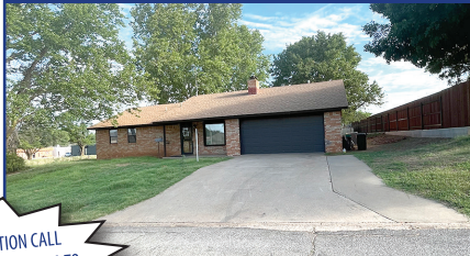
105 VIRGINIA AVE.

Sunday, July 21 & 28, 2024 from 1:00 to 3:00 p.m. or by appointment call 580-225-6743